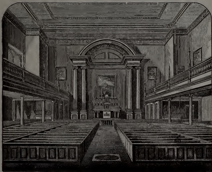
INTERIOR_OF ST. JOSEPH'S.